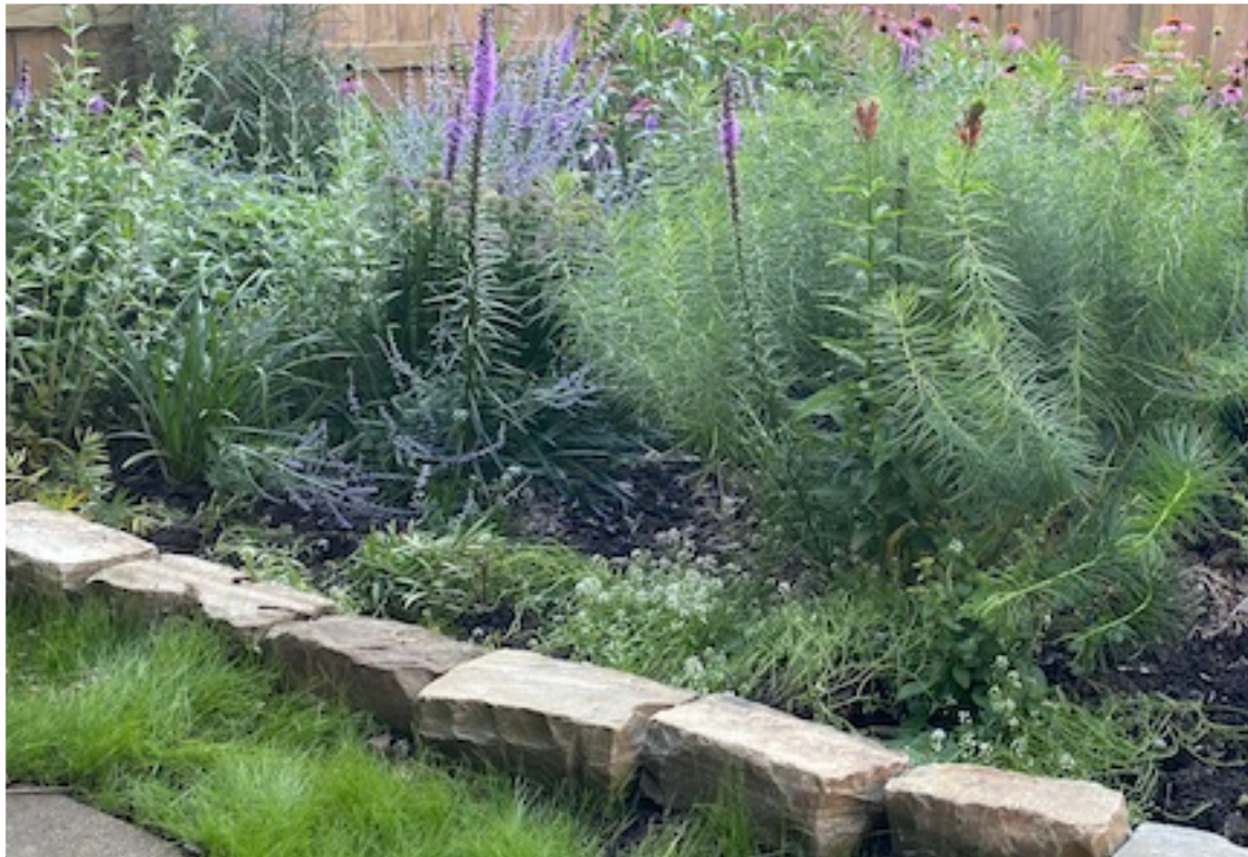
Example of Belgian block used as edging.

For a modern look, try plastic edging that is flush with the ground level or consider a CorTen steel edging product with a natural patina or a sprayed dark coating. If you'd like to reuse your existing Belgian block stone edging but don't have enough, try sourcing it from Craigslist or local Freecycle groups.